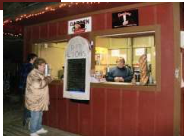
There's always a cowboy that shows up