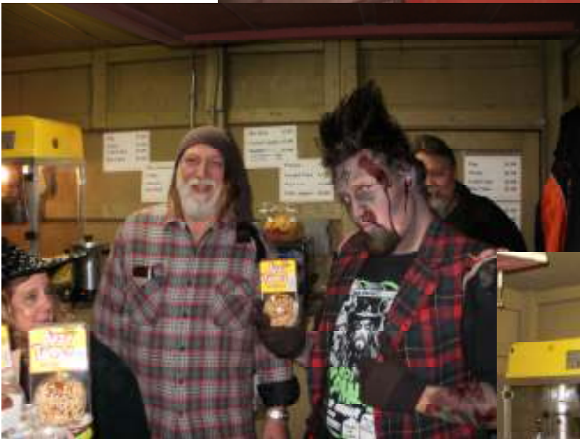
The cast loved to help - especially when there was free food involved!