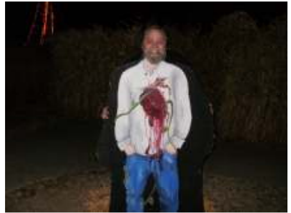
Best he's looked in a long time!